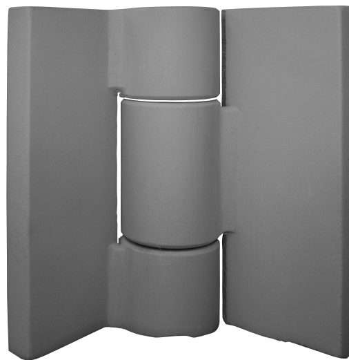
SF 205G: GAP HINGE